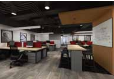
仲量联行南京总部