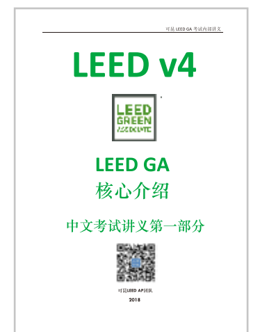
LEED GA 讲义