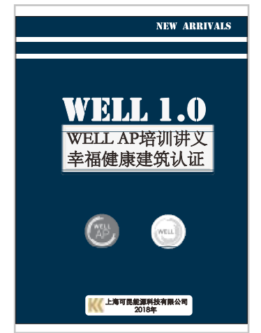
WELL AP 及项目用书