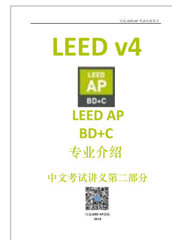
LEED AP 讲义