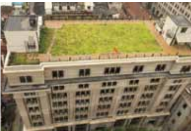
上海电气总部大楼